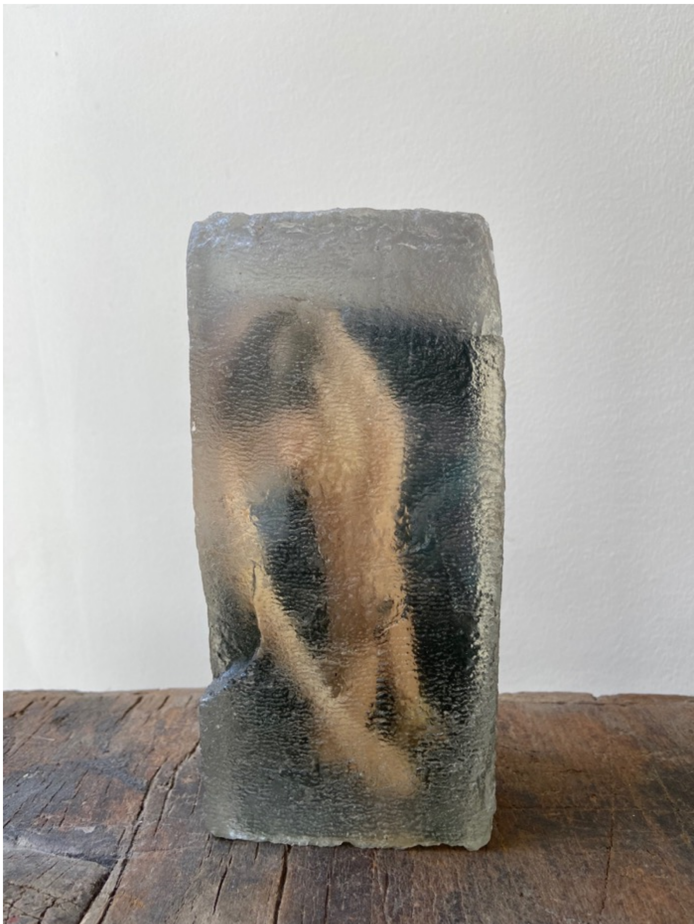
Ilan WEISS « Untitled », 2020 20x10x8 cm, ink photograph, epoxy // 900 euros