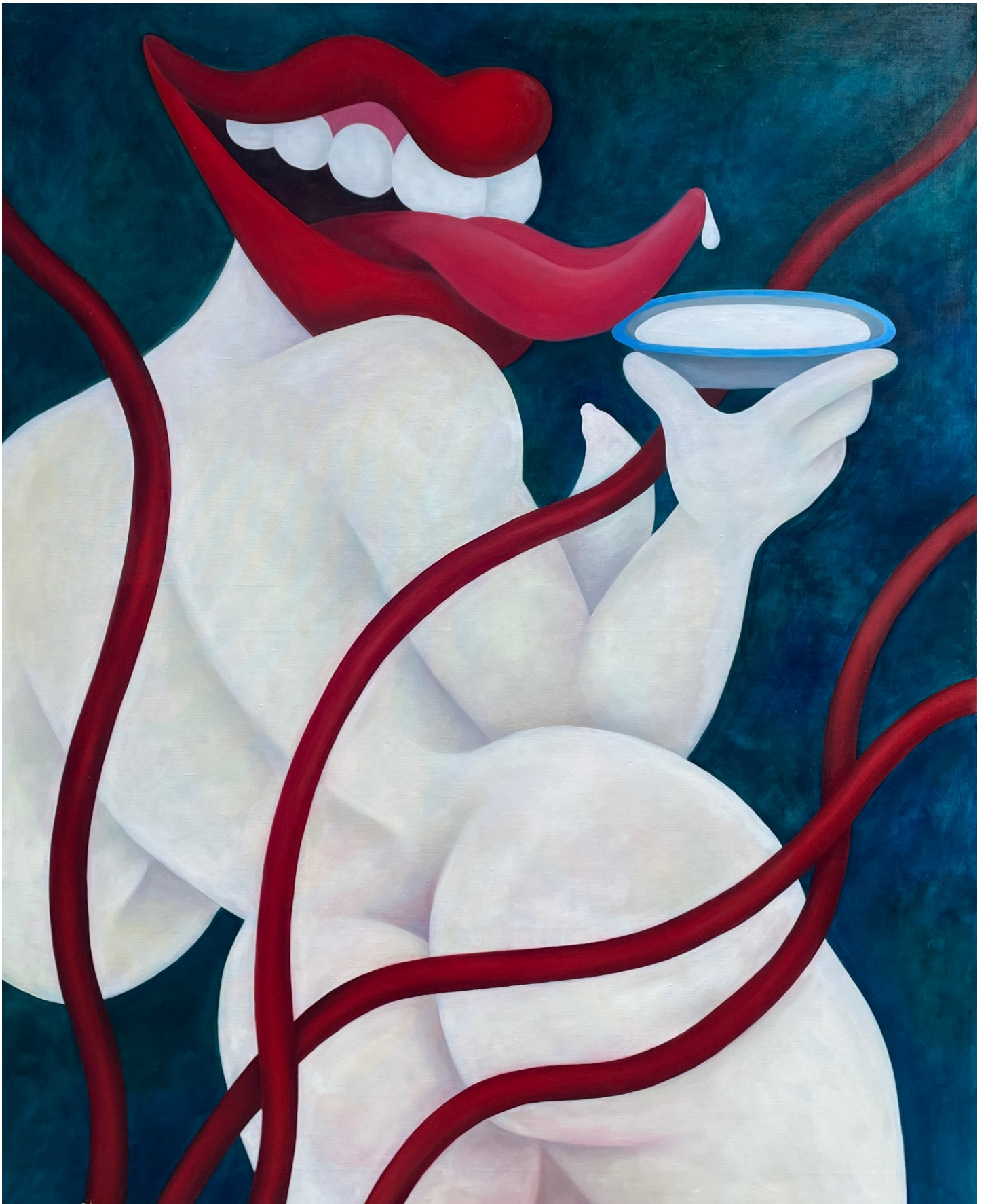
Tasya VASILKOVA « Milky », 2022 130x105 cm, oil on canvas// 4100 euros