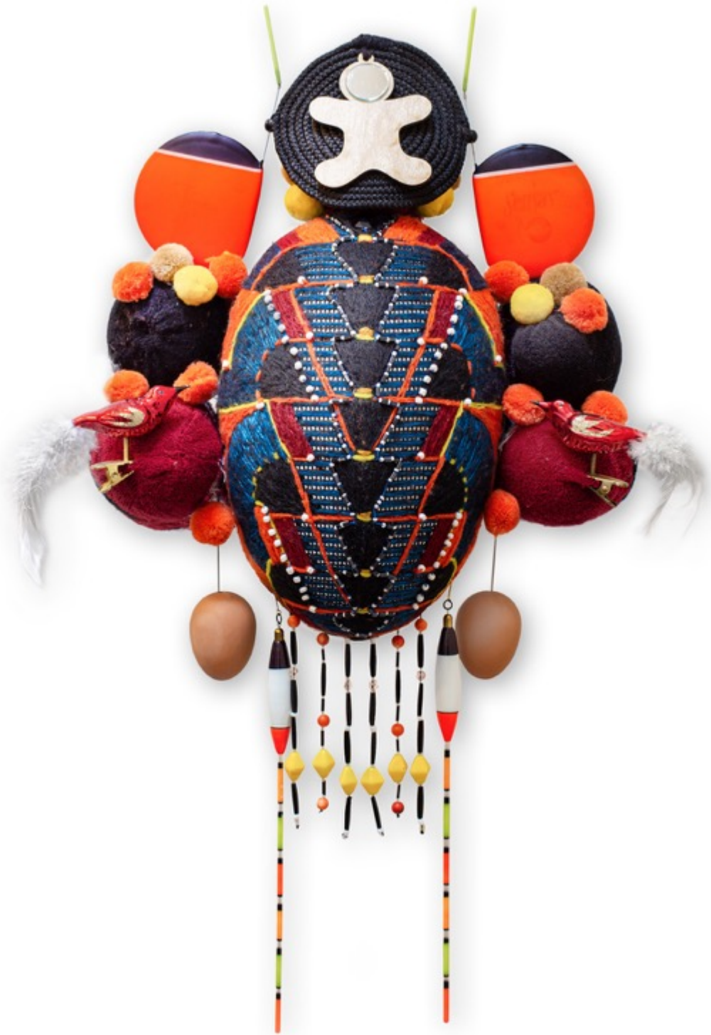
Oksana LEVCHENYA « Mask », 2019 H 50// L 35// P 30cm, fencing mask, mixed // 3500 euros