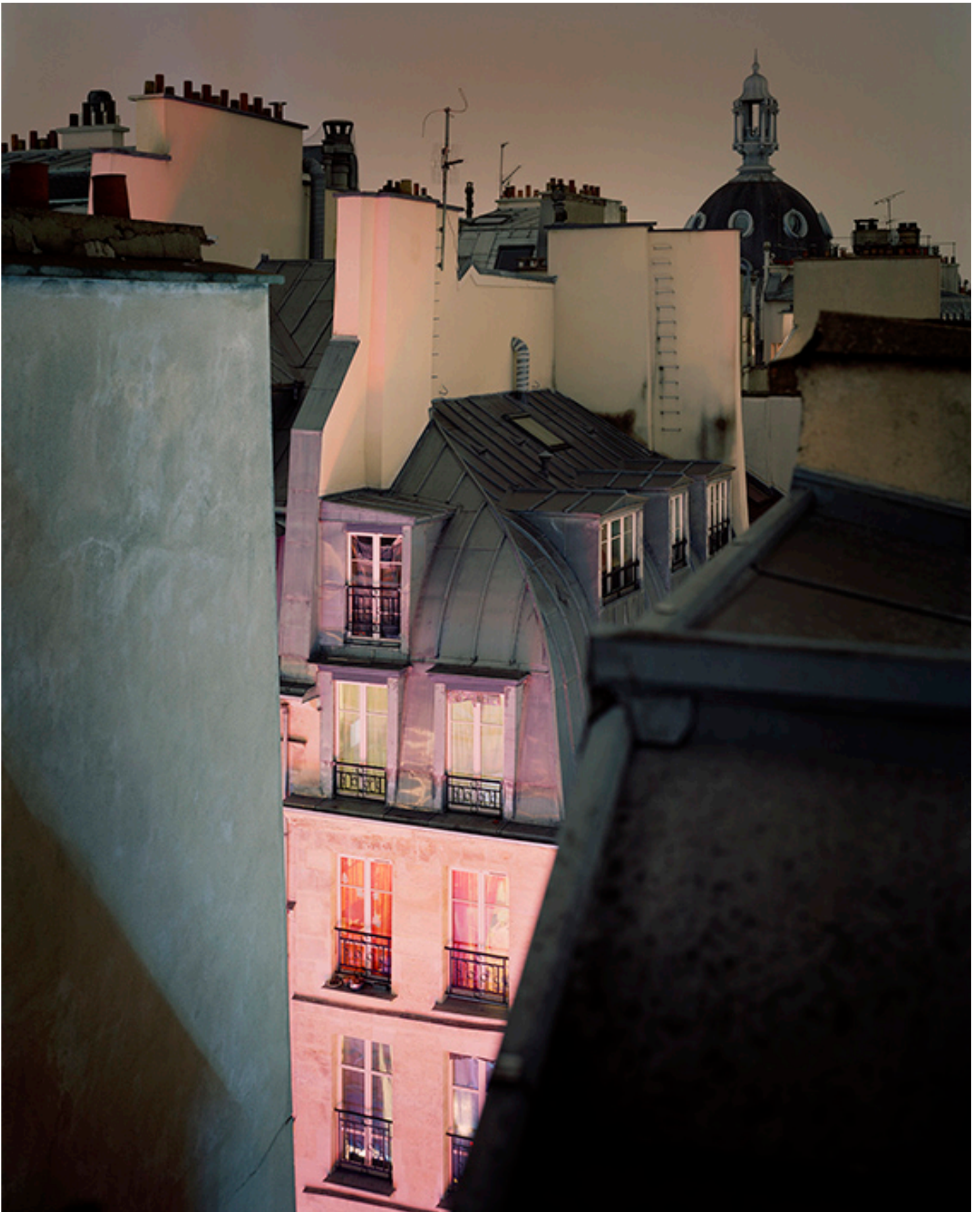
Alain CORNU « On Paris N°431 », 2018 50x40 cm, 3/5, inkjet print // 1800 euros