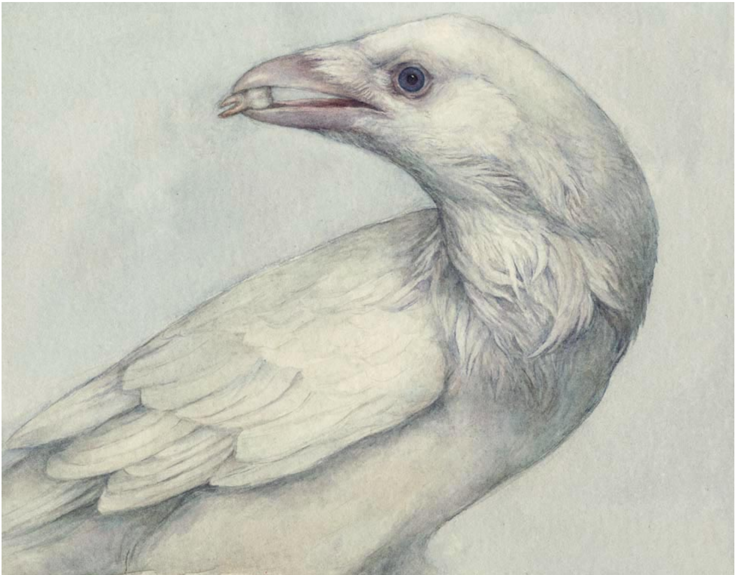
Nicolas TOLMACHEV «« Bad dream », 2015 21,5x27 cm, watercolor, pencil on paper// 1800 euros